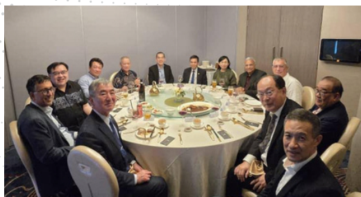
HOS Network members at the Fellowship dinner with Asian Hospital Federation leaders from hospital associations in the region.