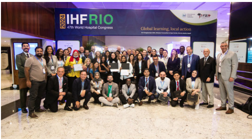
The IHF YEL 2024 Programme Cohort.