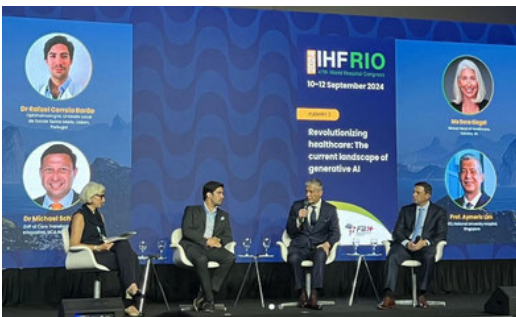
Prof Aymeric Lim, CEO, NUH speaking at the plenary on Revolutionizing healthcare: The current landscape of generative AI .

The National University Health System is an example of how AI-driven innovation can revolutionize healthcare delivery to meet rising demands, setting a global benchmark for efficiency and quality in patient care ( IHF News & Insights Article ).