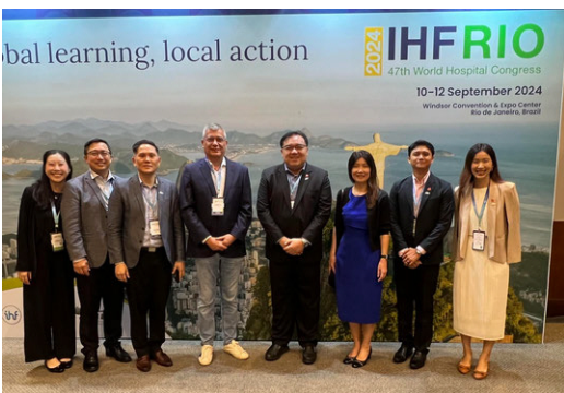
The HOS Leadership Delegation at IHF WHC 2024 in Rio de Janeiro.

Applications for the YEL 2025 programme will open in January 2025.