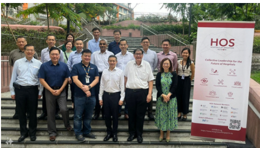
The HOS Leadership Visit at Woodlands Health.

It was a wonderful opportunity for members to connect and share ideas, setting a positive tone and strengthening bonds for the year ahead.